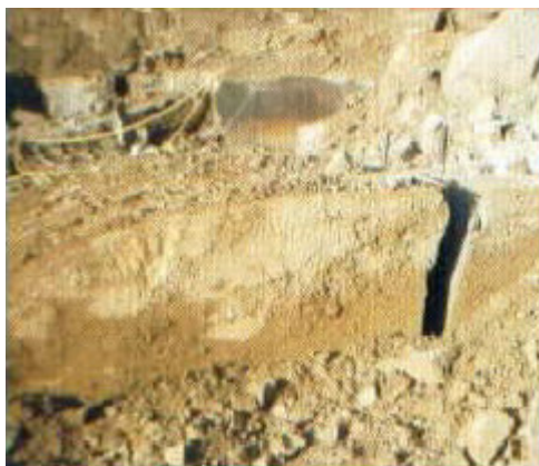
Two CARDOX Tubes split and heave a block of over 50 tonne.