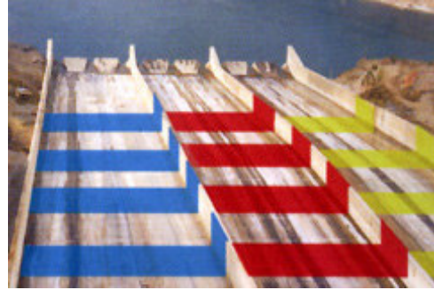
The Keban Dam, Eastern Turkey Breaking out of 4 channels each 6.5m wide across spillways of dam.