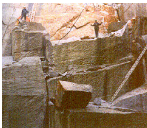
When using CARDOX, very little wastage results, as the gas splits and heaves along natural fissures and bed planes.