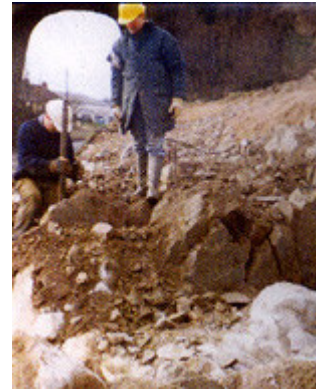
Newry Bypass - Excavation of rock adjacent to busy road.