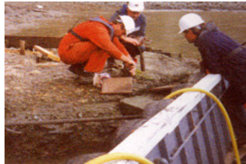
CARDOX Tubes are placed and wired - up.