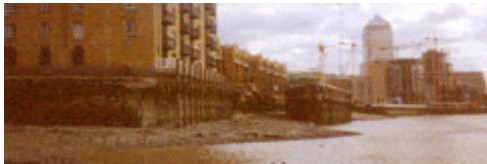
Busy stretch along River Thames, London. Excavation of reinforced concrete dolphin adjacent to exclusive new apartment block and half a mile from the tower of London in one direction and Canary Wharf seen in the background.