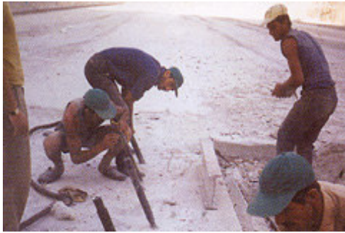
Before: CARDOX Tubes placed in drill holes.