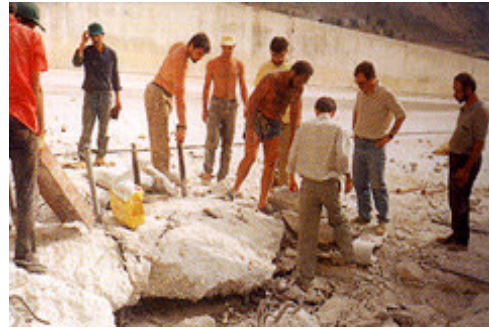
After: Engineers view the results. The reinforced concrete is completely broken.