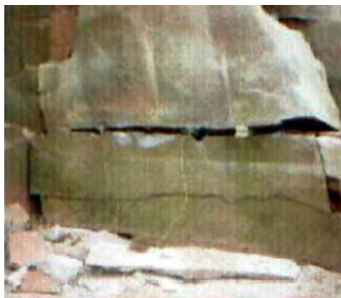
CARDOX Tubes applied horizontally to lift a block along its natural bed plane.