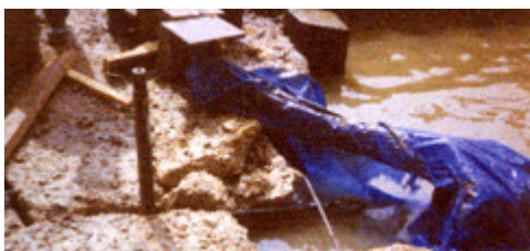
CARDOX Tubes break the reinforced concrete.